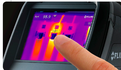
Large 3.5" Touchscreen