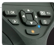
Large Backlit Buttons For Easy Push Button Operation