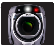
Visible Light Pictures Align with Thermal Images: 3.1MP Digital Camera, LED Lamp, and Laser Pointer