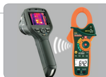
Wireless METERLink™ Communication via Bluetooth®